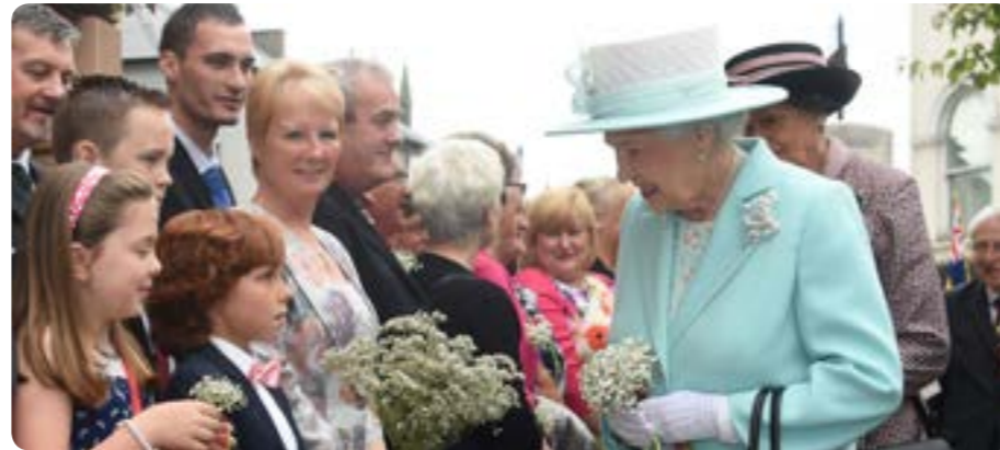
The Queen meets lots of people.

Elizabeth II is the Queen of the United Kingdom. She was born in 1926 and became queen in 1952. The Queen is married to Prince Philip and has a large family. She lives in Buckingham Palace in London. The Queen is very important. She visits charities and schools in the United Kingdom and welcomes world leaders to Buckingham Palace.