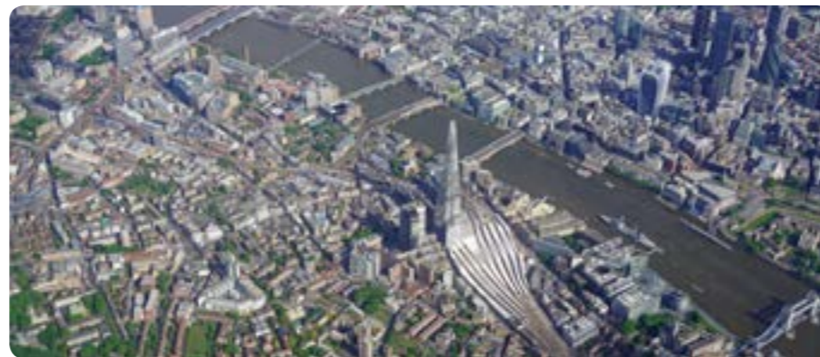
Aerial view of London

A city is a large, busy settlement where lots of people live and work. A city usually has a cathedral, a river, important buildings and offices where people work. There are lots of things to see and do in a city. There are many shops and restaurants to visit.